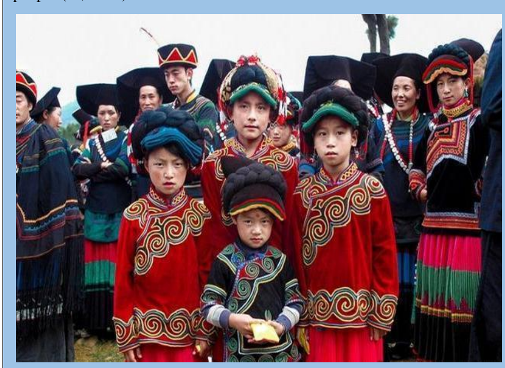
Yi People in traditional dress https://zi.media/@yidianzixun/post/bR81Hb

Yi people belong to an ethnic group also known as Nuosuo or Lolo people. They are located in Southwest China, part of Vietnam and Thailand. They have been recognized as the seventh largest ethnic minority group in China. Total population counted around nine million people (Li, 2003).